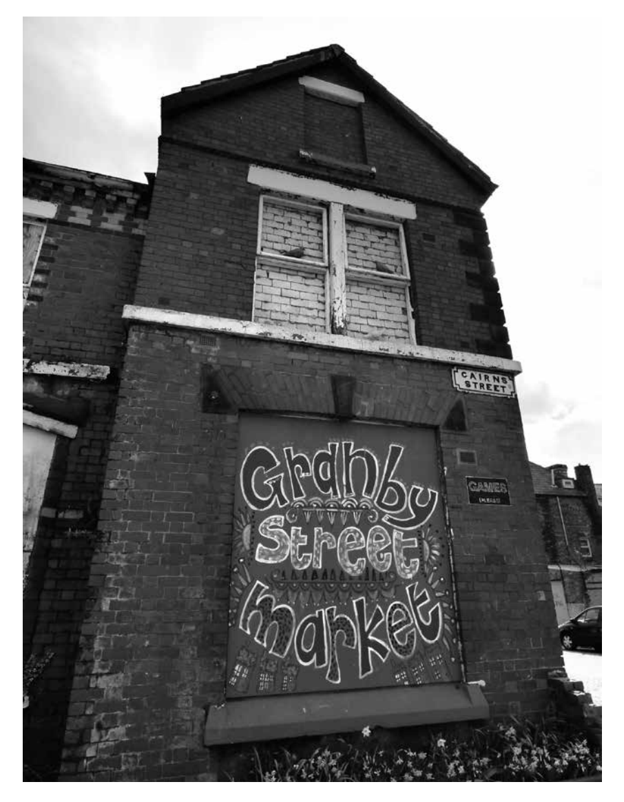
Figure 4 Subverting "target hardening" with artistic symbols of hope.

perhaps, point to a brighter, alternative future for the neighbourhood. The most prominent window infills of grey breezeblocks were boarded over and emblazoned with messages of hope and resilience: "DON'T GIVE UP!" An enduring graffito reads "GAMES (PLEASE)"—a playful subversion of conventional signs banning ball games and a symbol of the carnivalesque spirit imbuing Granby's activism.