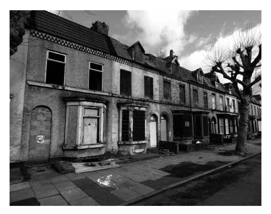
Figure 1 Dilapidated dwellings and neighbourhood abandonment in Liverpool 8 in 2015.