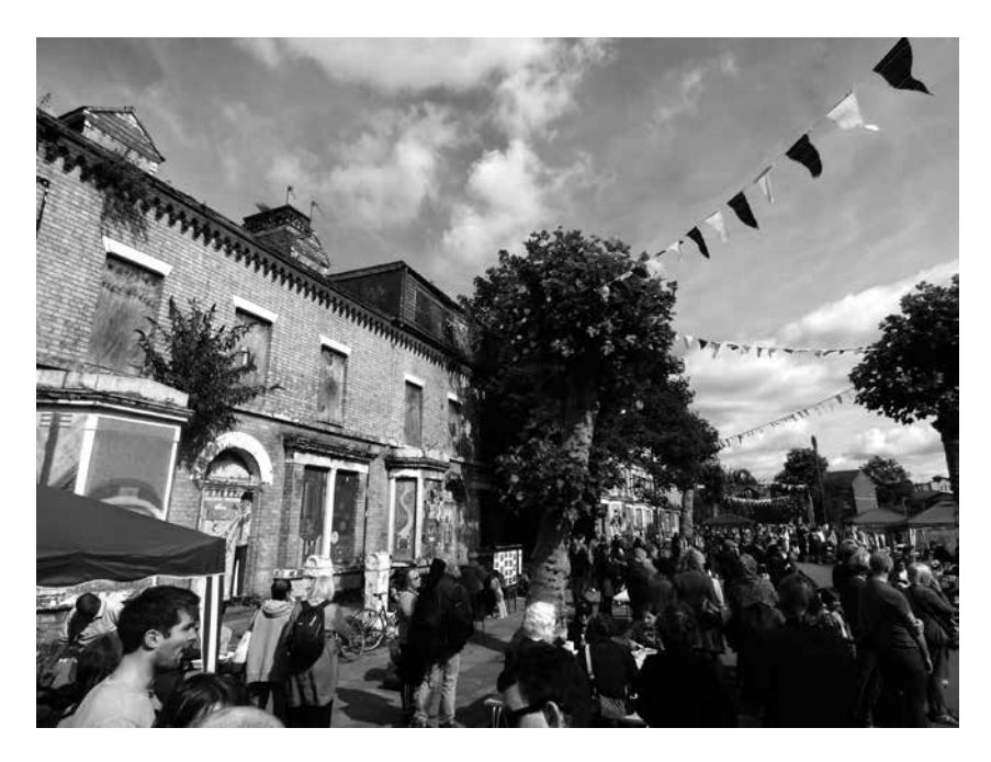
Figure 5 Granby Street Market relocated to Ducie Street during Cairns Street renovation, 2015.

negotiations with the council over the future of their neighbourhood. Not long after, however, in early 2012, the council put the four streets up to tender—welcoming the best bids from private developers and housing associations—and entered into long negotiations with a private development company, Leader One, effectively shunting the CLT off the negotiating table.